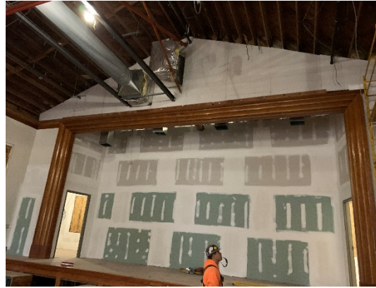
Media Center Drywall Top Out