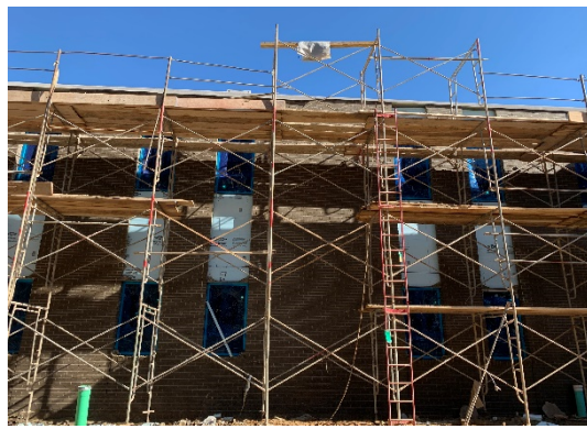
Exterior Masonry Brick