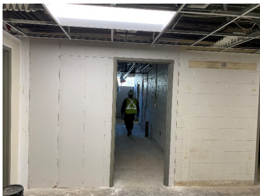
Interior Door Frame Installation