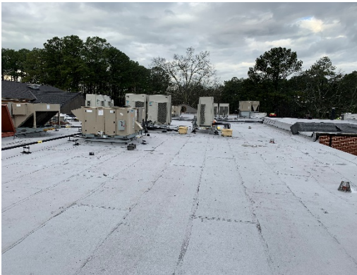
New Roofing System